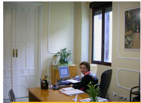
zador spanish school in alicante