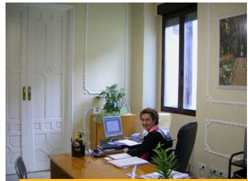
zador spanish school in alicante