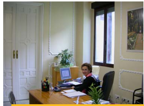
zador spanish school in alicante